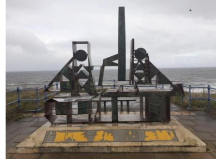
Local Heritage Listings