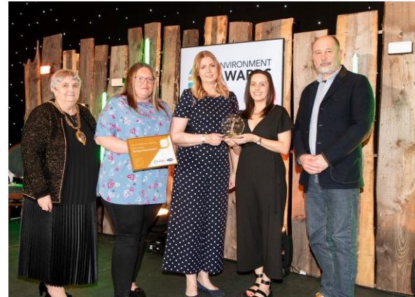
Eat Smart Waste Warriors of Cestria Primary School