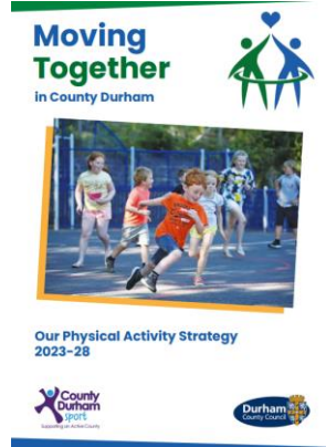
Our Physical Activity Strategy 2023-28